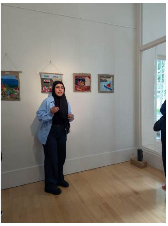
Workshop participant and contributor sharing her feelings about her life in Northern Ireland