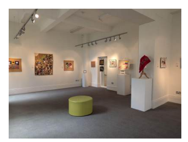
Overview of the exhibition space galleries