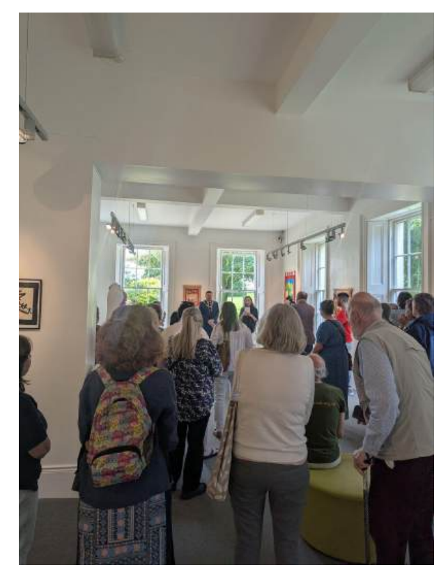
Attendees listening to the opening remarks

The exhibition opening and welcoming area